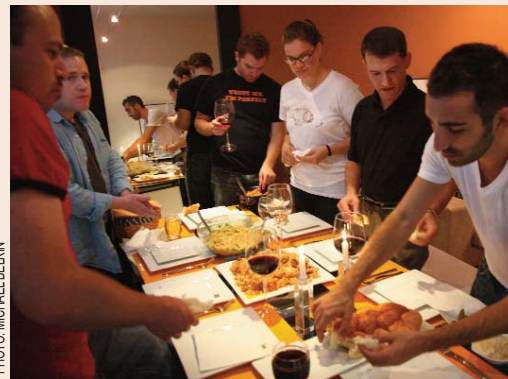
Members of the 20s/30s Havurah enjoy a Shabbat dinner.

If you would like to be on our mailing list, have any event ideas, or are interested in joining our leadership, please email 2030havurah@gmail.com .